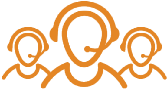
Call Duration by Call Type